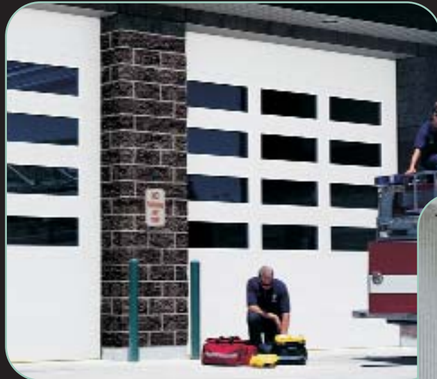
TriCore STANDARD, white, with full-view windows