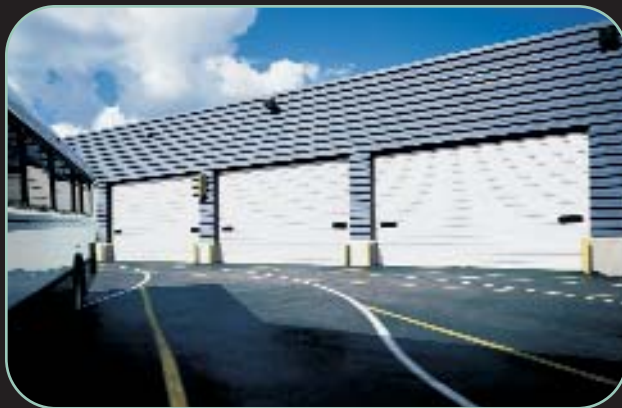
SteelForm STANDARD, white, with oval windows