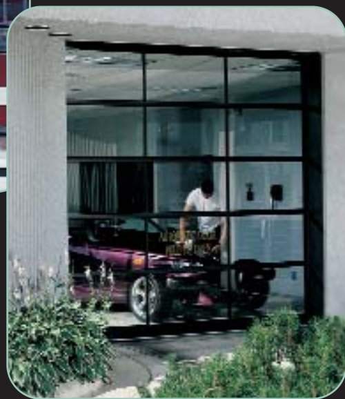
AlumaView STANDARD, bronze-anodized